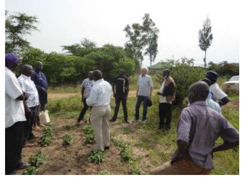
Figure 2: The agriBORA team talking to farmers in Siaya county

smallholder farmers produce about 70% of the country's food. Many of them grow high-value crops such as maize, soya beans, sunflowers, Irish potatoes and rice. The value chains are highly fragmented. Individual farmers have problems accessing credit to purchase seeds and fertiliser or obtaining insurance. They get very little advice during the growing season (one of the problems Kizito had identified with Kedo Solutions) and they have difficulty getting fair prices for their harvests, often being forced to sell through middlemen.